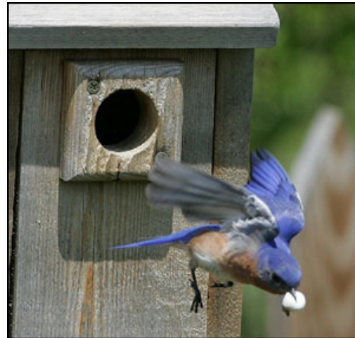
Some men do house cleaning