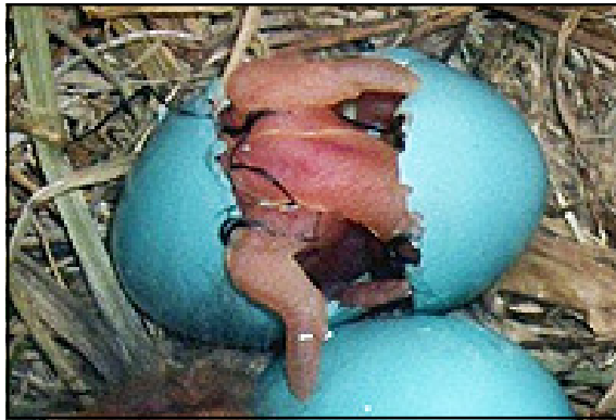
Whew, wonder what's out there.

CBRP members are encouraged to mark their calendars and attend the conference. Complete information and links can be found on the SCBC website, http://www.socalbluebirds.org . and on the NABS website, http://www.nabluebirdsociety.org/ . All CBRP members are encouraged to attend, so get your reservations in early to save and to ensure your place in the workshops and field trips.