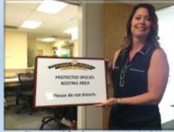
Sign used for large snag in N CA

Attended the annual conference of the Western Chapter of the International Society of Arboriculture.