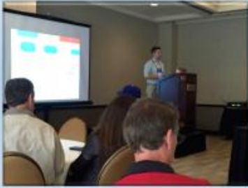
Ryan Gilpin promoted tree care for birds